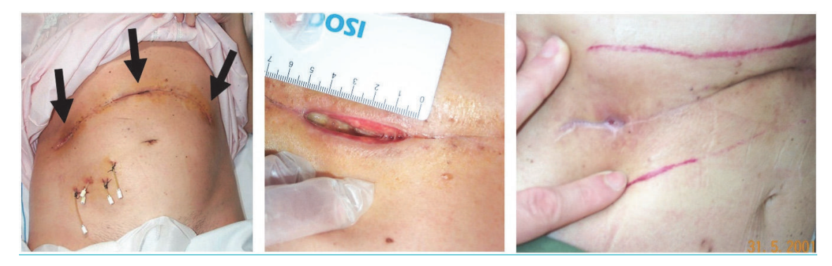
FIGURE 4: Delayed healing after a pancreatic cancer surgery. Fifty-three-year-old female patient with pancreatic carcinoma. During 1st surgery, tumor resection was not possible. She was treated with RT and CT. During a 2nd surgical intervention, complete tumor resection was not possible due to large vessel infiltration, and catheters were inserted for brachytherapy (a localized way for RT administration). ( Left ) Fourteen days after surgery. Note the catheters for brachytherapy in the lower-right abdomen. At this time, there were 3 wounds indicating delayed healing (arrows), all of which are larger than 40x10x10 mm. Pancreatic cancer cells were confirmed in the wounds. Local O<sub>3</sub>T was applied together with a 3rd course of RT (2nd external beam RT—this time, with electrons). ( Right ) Six weeks later. Complete wound healing (despite tumor cells) was observed during the 3rd RT after 15 sessions of local O<sub>3</sub>T.

FIGURE 3: Delayed healing after pelvic surgery. Twenty-one-year-old patient with advanced and refractory Hodgkin lymphoma after several lines of CT and previous thoracic RT. A few days after commencement of pelvic RT, the treatment was discontinued because patient required surgery for appendicitis. ( Left ) Before O_3T : wound delay 12 days after surgery and standard management (13.5 cc volume: 60x15 mm by 15 mm deep). We decided to apply local O_3T and restart RT. ( Right ) After 5 O_3T sessions during 3rd week of RT. Wound closed completely after 8 O_3T sessions in 24 days during RT.