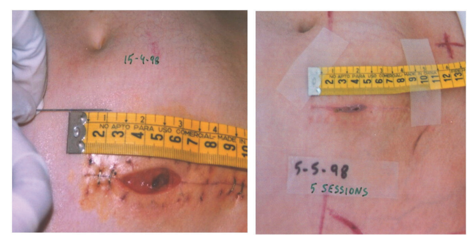
FIGURE 3: Delayed healing after pelvic surgery. Twenty-one-year-old patient with advanced and refractory Hodgkin lymphoma after several lines of CT and previous thoracic RT. A few days after commencement of pelvic RT, the treatment was discontinued because patient required surgery for appendicitis. ( Left ) Before O_3T : wound delay 12 days after surgery and standard management (13.5 cc volume: 60x15 mm by 15 mm deep). We decided to apply local O_3T and restart RT. ( Right ) After 5 O_3T sessions during 3rd week of RT. Wound closed completely after 8 O_3T sessions in 24 days during RT.